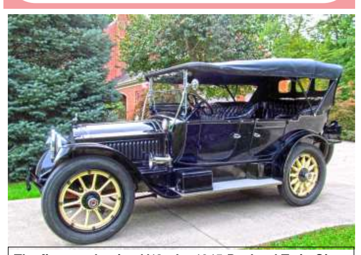
The first production V12, the 1915 Packard Twin-Six. (Question 3)